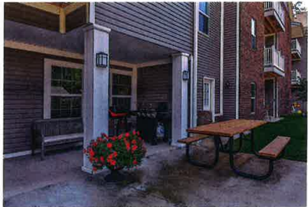
Capital Greene Senior Living, Wheeling WV

Williams Terrace will consist of a mixture of one-, and two-bedroom units with approximately 650 and 850 square feet of living space each. All the units will have central air conditioning, dishwashers, garbage disposals, refrigerators, stoves, mini blinds, ample storage space, and attractive open designs. The development will include a community room featuring spaces that can be used by residents for recreation, health care, education, etc. Security features will include secured building entrances, as well as security cameras and typical building and unit security features.