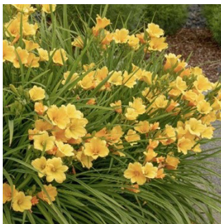
Stella De Oro Daylily