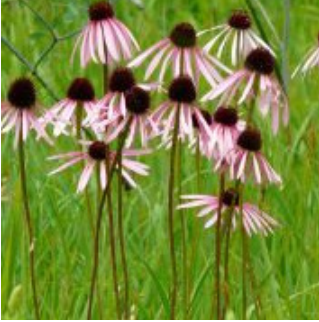
Pale Purple Coneflower