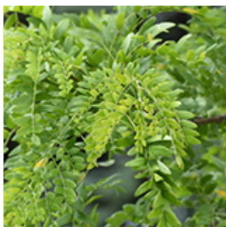
Street Keeper Honeylocust